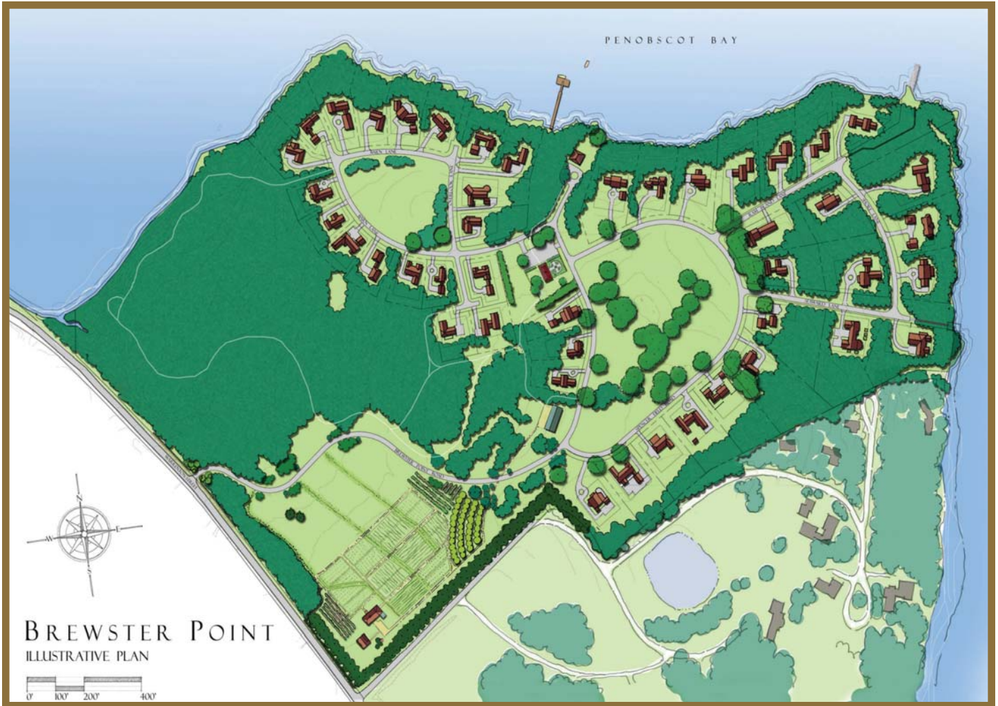
PICTURE — Illustrative concept plan showing 45 house lots, farm and green space