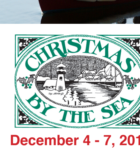
December 4 - 7, 2014